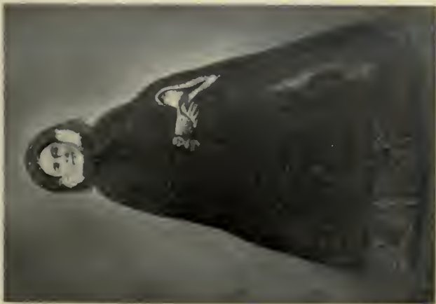
THE PRINCESS MATHILDE. (From a photograph.)